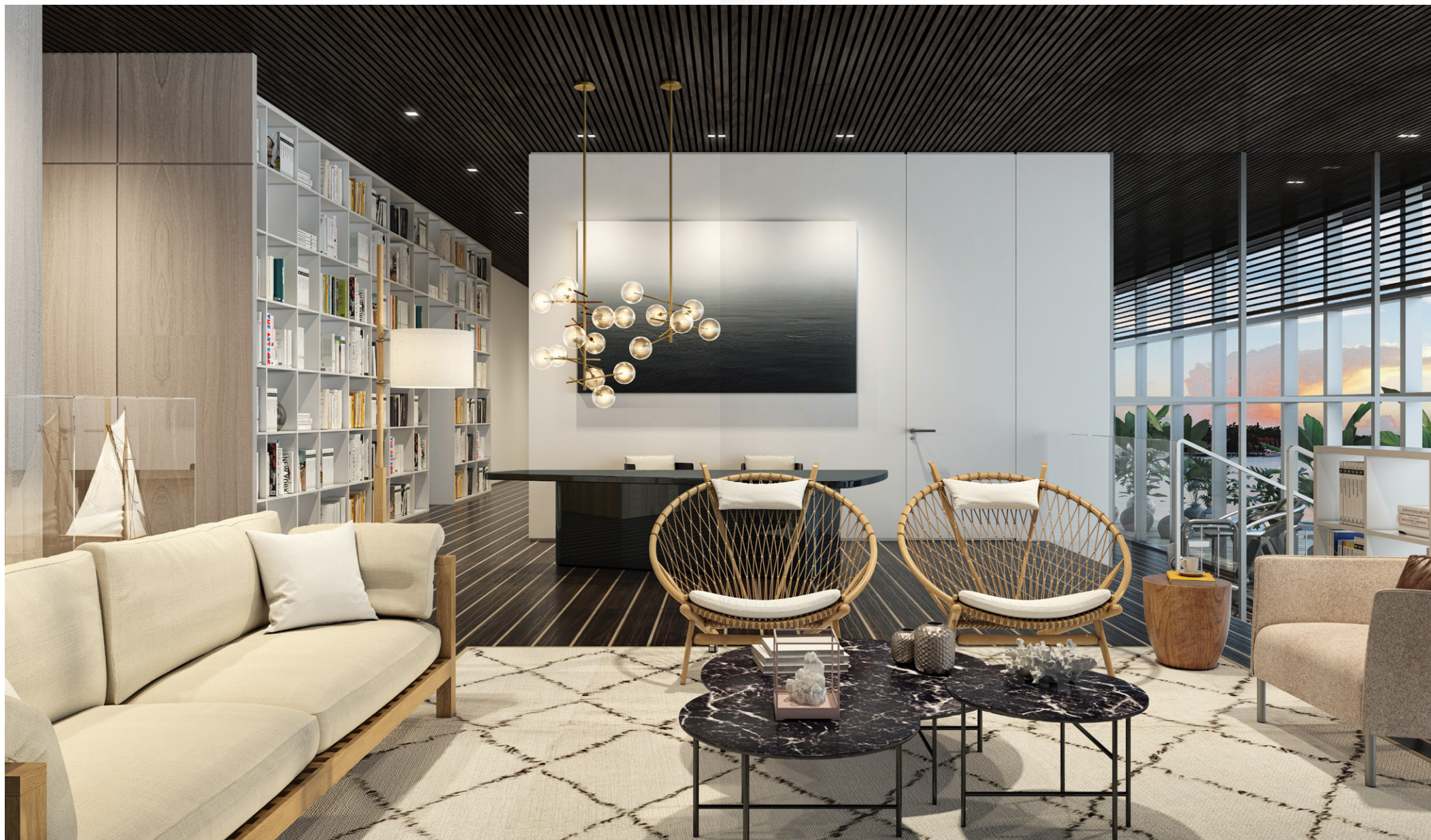
Côte d'Azur-inspired reception and lobby areas, curated by Lissoni®