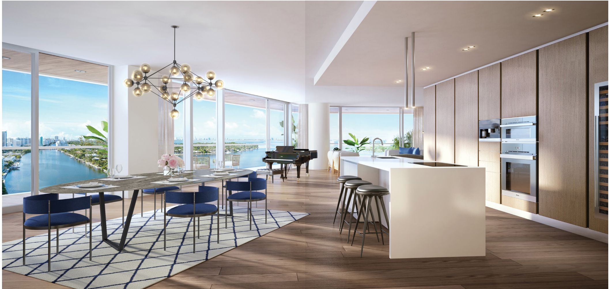
Boffi® contemporary, Italian kitchens feature imported stone countertops and Miele® appliances including built-in coffee maker and wine storage.