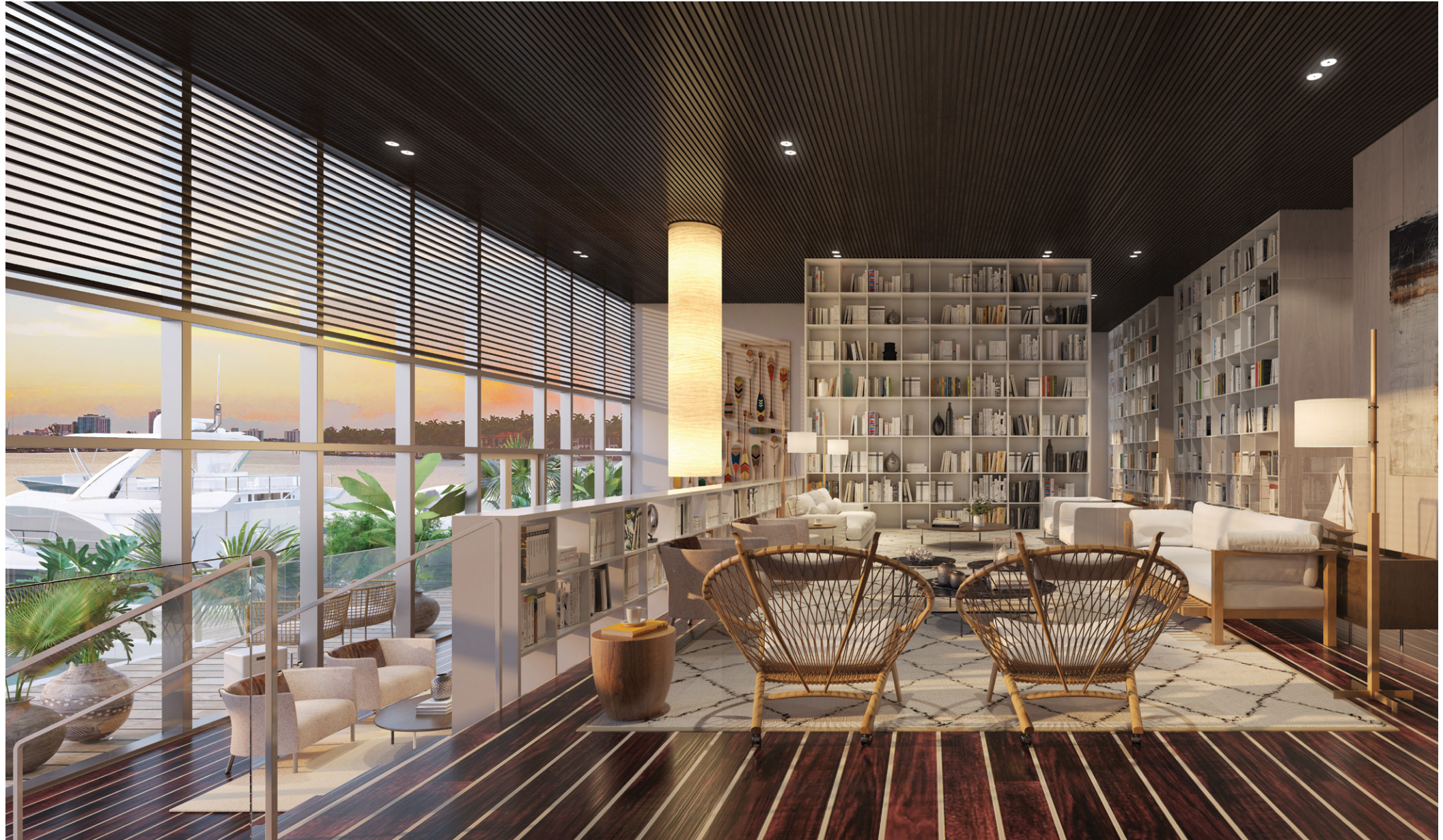
Floor-to-ceiling windows in the double-height lobby frame sweeping views of the Intracoastal and private marina.