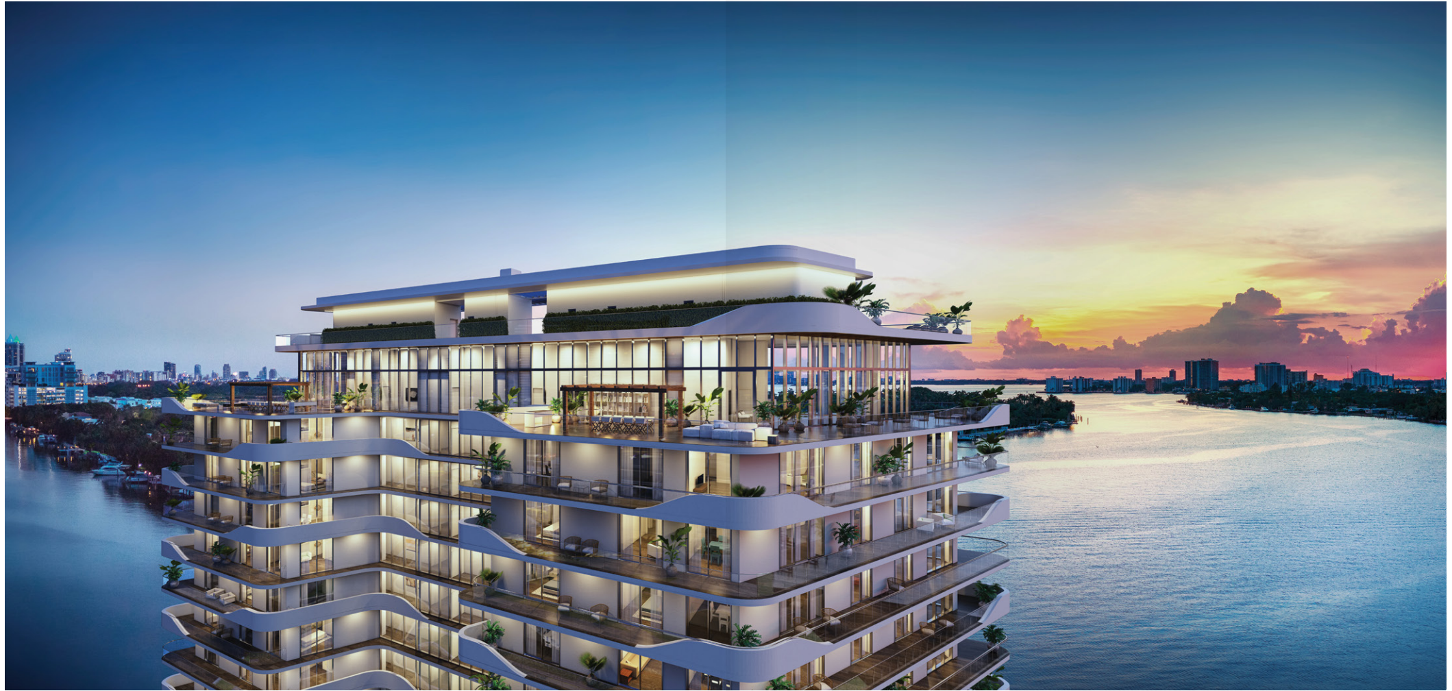
Two half-floor penthouses feature expansive wrap-around, rooftop terraces framing panoramic views of Biscayne Bay and the Atlantic Ocean.