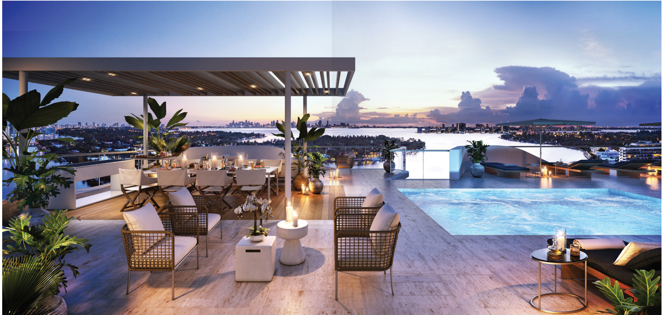
Rooftop pool, jacuzzi and sun deck with private lounging areas feature an outdoor grill and chef's table for entertaining.