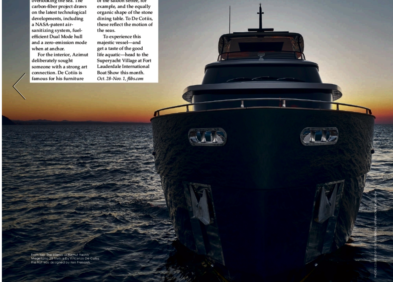
From top: The interior of Azimut Yachts' Magellano 25 Metri is by Vincenzo De Cotiis; the hull was designed by Ken Freivokh.