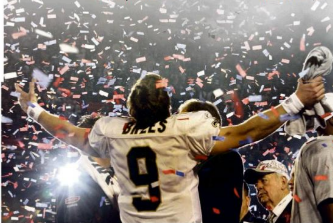
New Orleans Saints quarterback Drew Brees enjoys the moment after the Saints won the 2010 Super Bowl over the Indianapolis Colts at Sun Life Stadium.